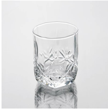
clear shot glass