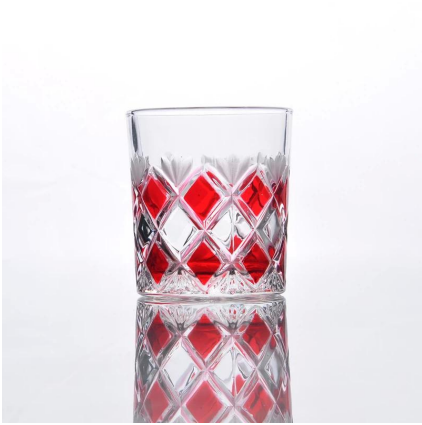
colored shot glass