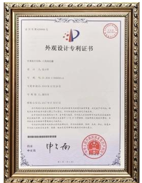
Patent no.: 201630655323.4