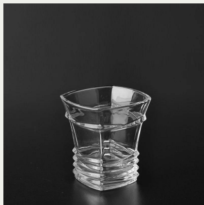
clear shot glass