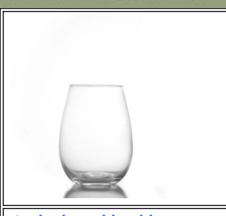
stocked machine blown stemless wine glass