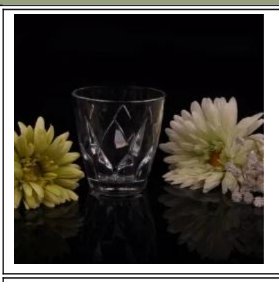
Personalized whiskey glass