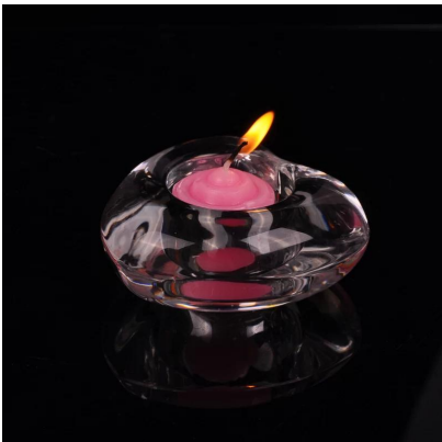
heart shape glass candle holders