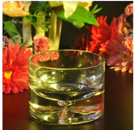
candle holder glass water drop