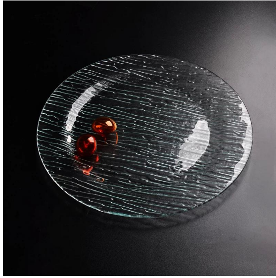
round clear glass plate