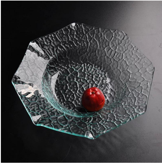
_polygon clear glass plate