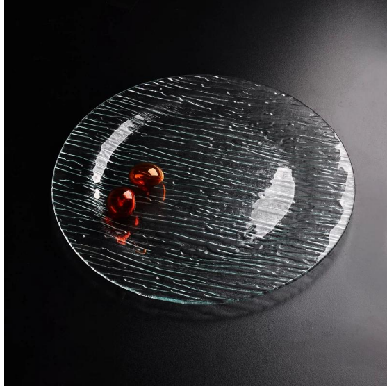
round clear glass plate