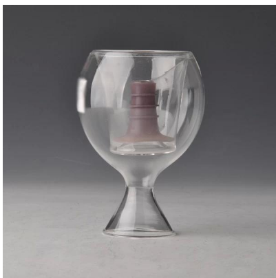
Special borosilicate glass cup