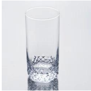
Heat-resistant glass water tumbler