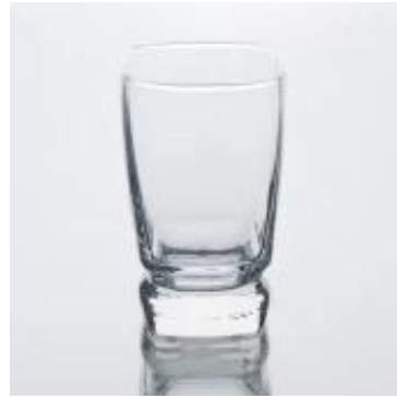
Latest design glass cup