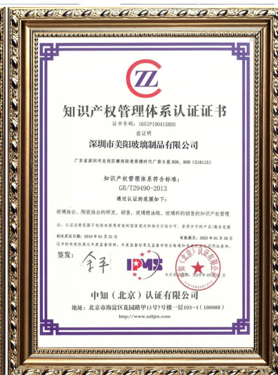
Company intellectual properties Patent number: 201630655323.4