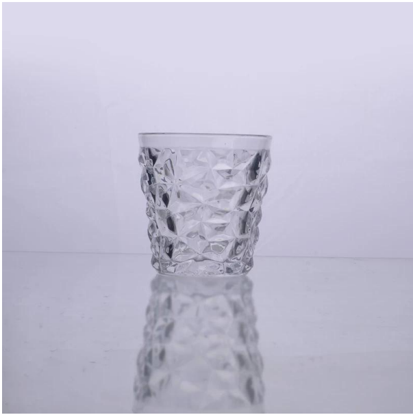
pattern glass candler holders