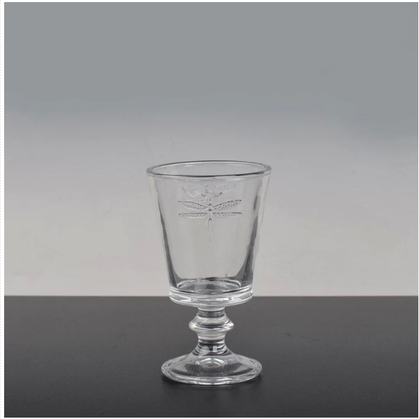
candle holder glass stemmed