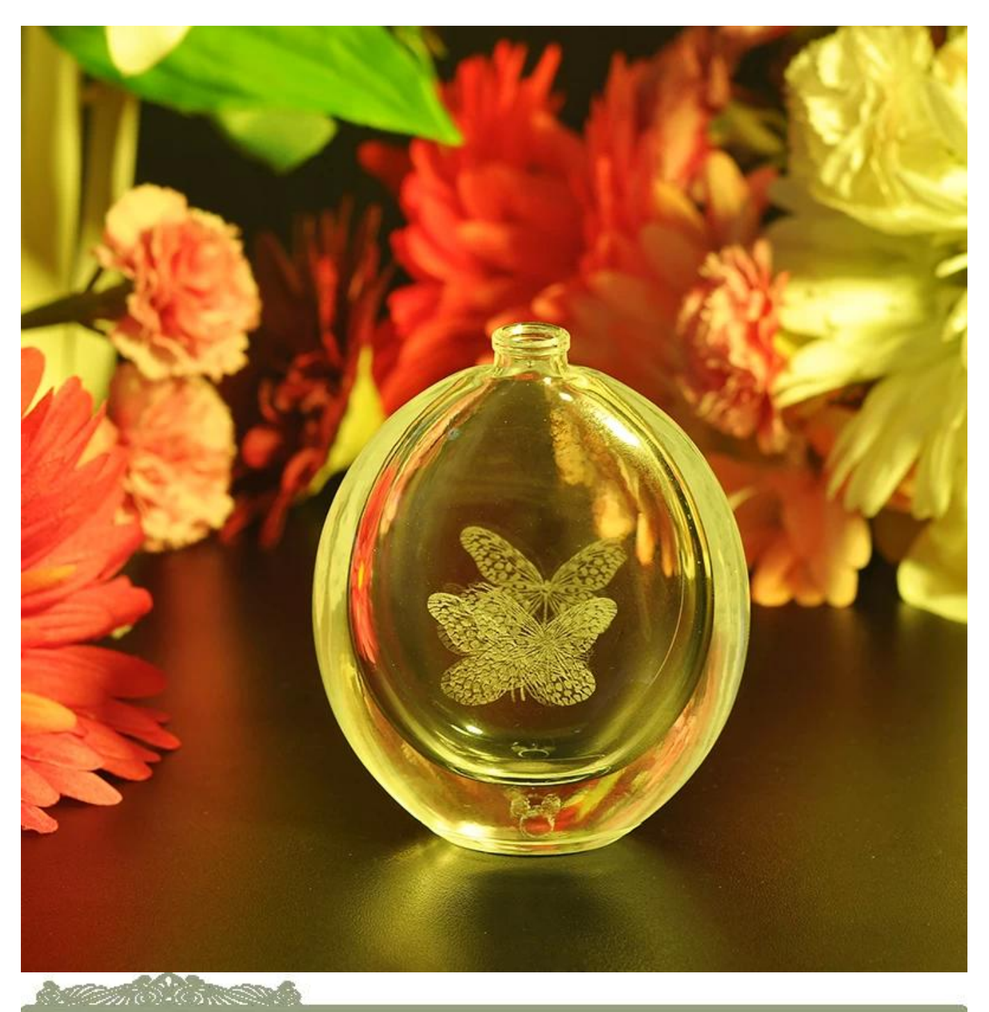
Similar Products Link