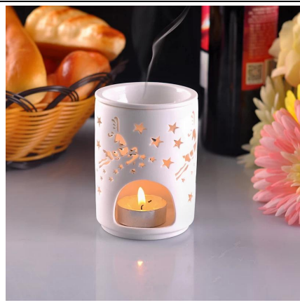
hollow design ceramic vigil lamp candle holder