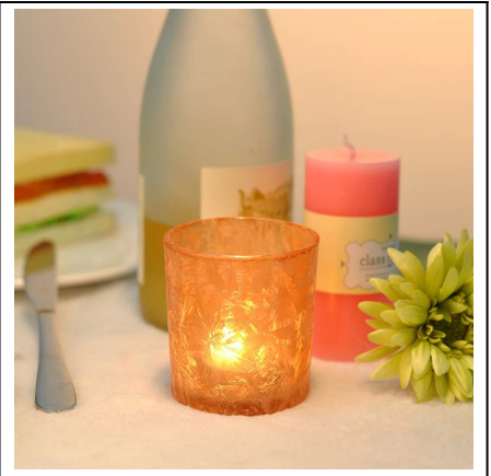
Frosted Glass Votive Candle Holders