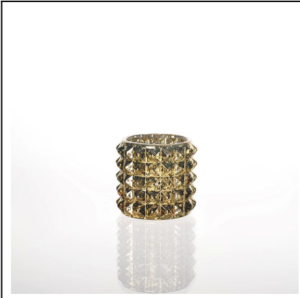
premium candlestick crystal candle holder