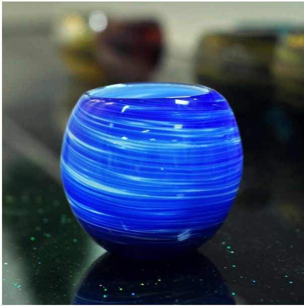
mouth blown glass candlestick