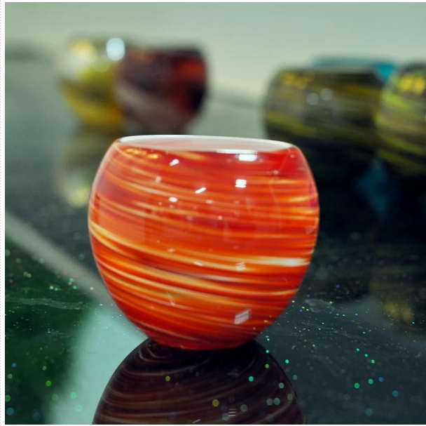
new glass candle holder