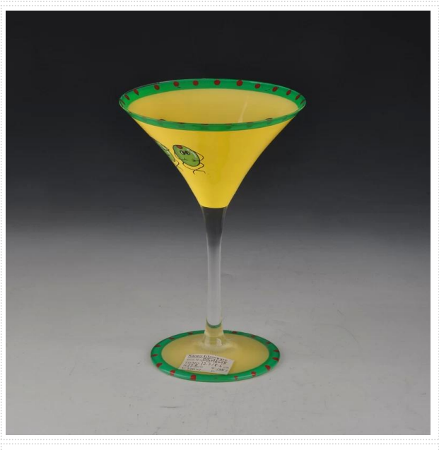
hand painted martini glass