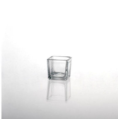
square clear glass candle holder