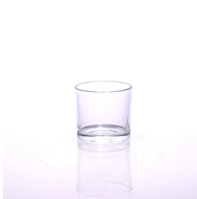
machine made glass candle holder