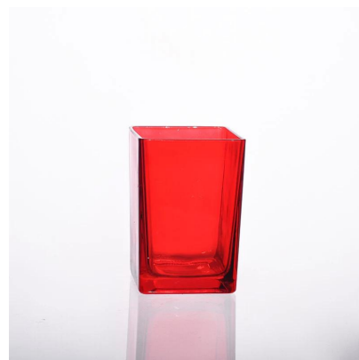
spray color glass candle holder