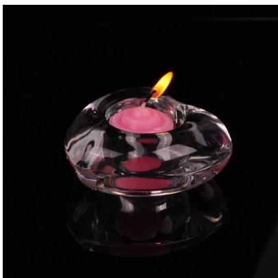
heart shape glass candle holders