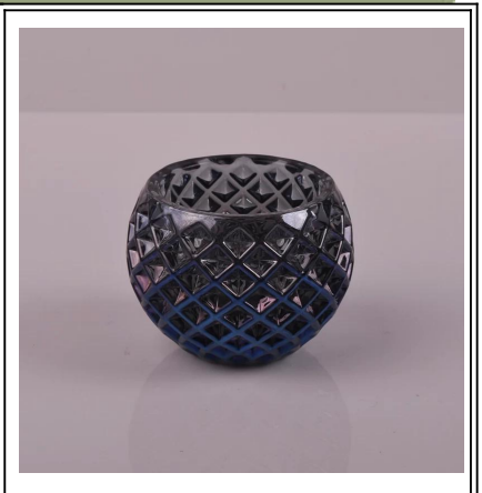
glass woven pattern candle holders