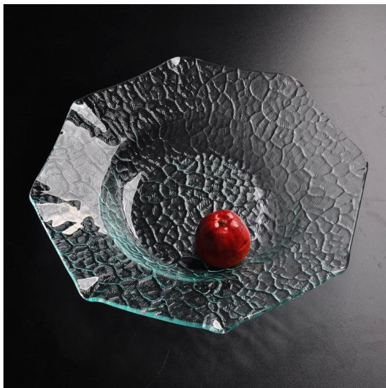
_polygon clear glass plate