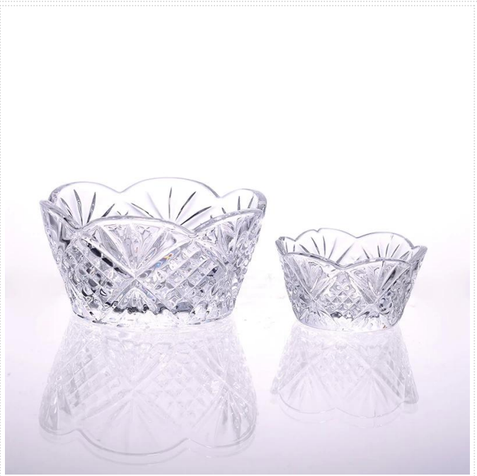
glass sugar jar with embossed nice patterns