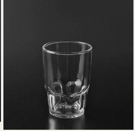
new design glasses