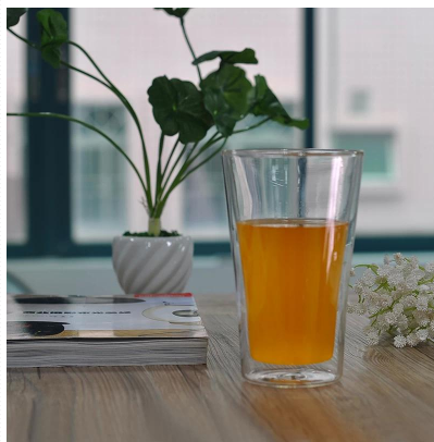
Double wall glass beverage glass