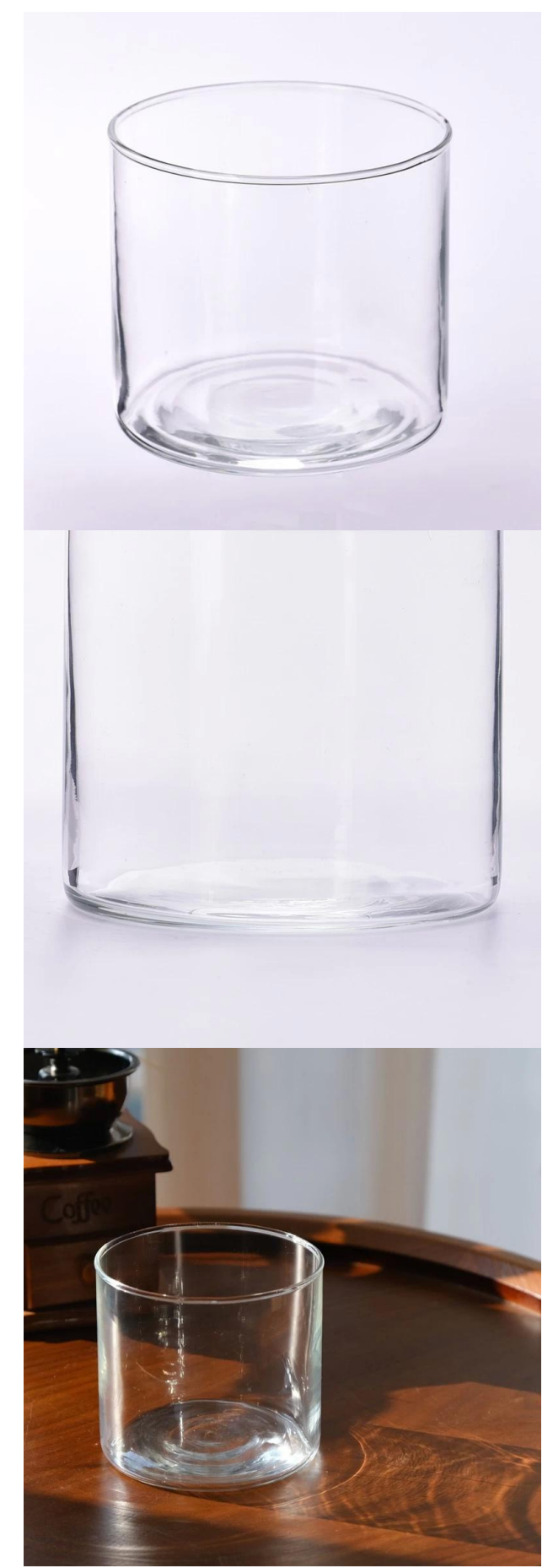
Application: Decorative dinner in the bar or bar . Suitable for families, hotels or gardens . Special lover gift . Any chance of decoration