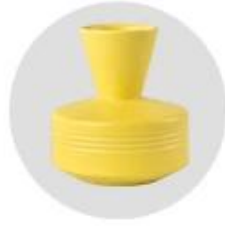
Solid color glaze