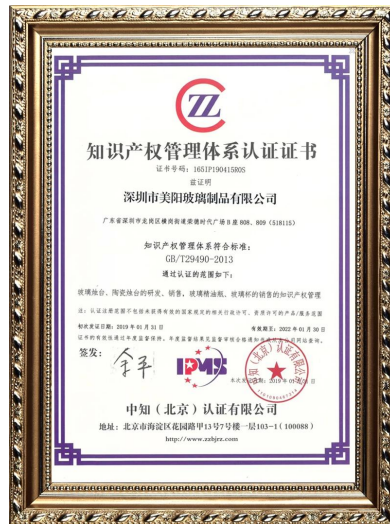
Enterprise intellectual property