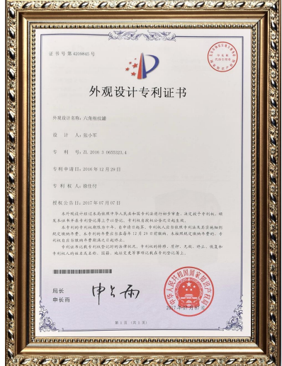
Patent Number: 20163065532.4