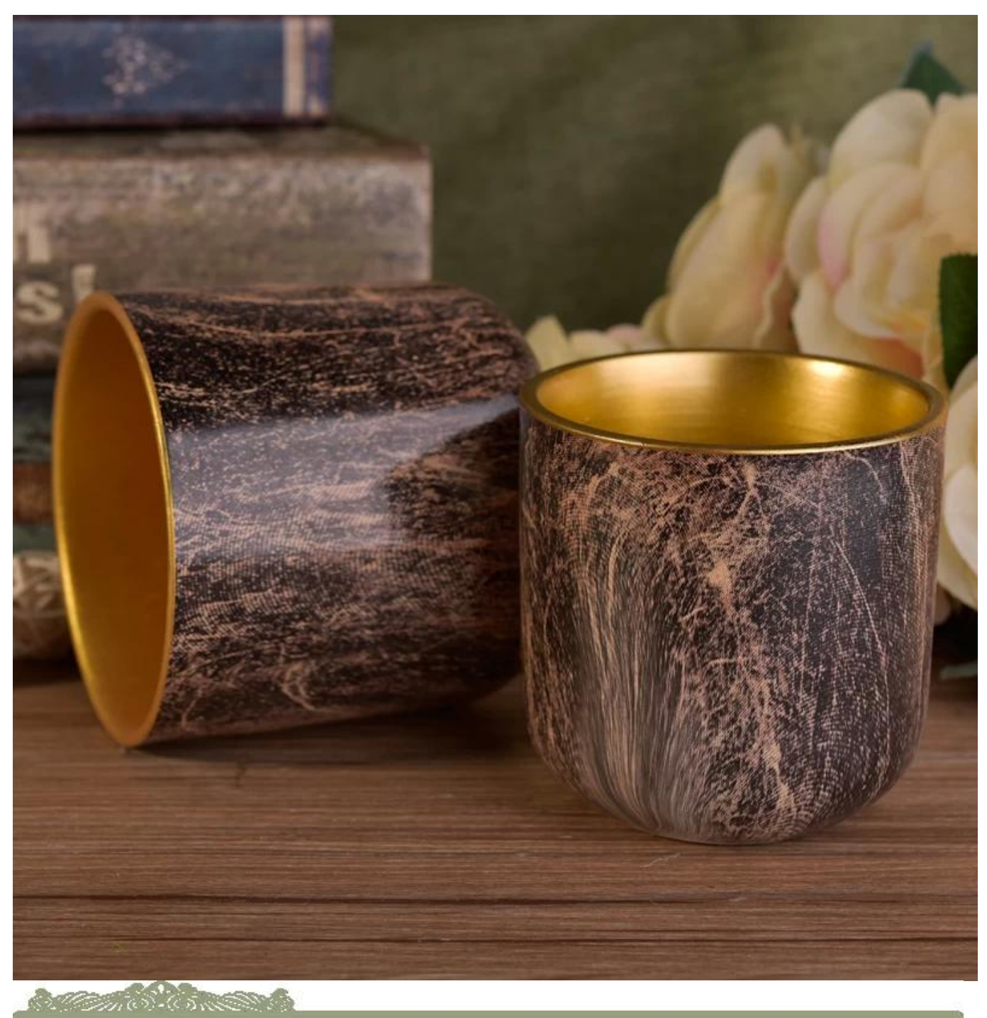
Similar Products Link