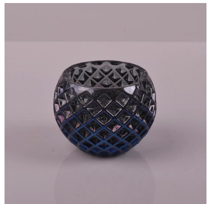
glass woven pattern candle holders