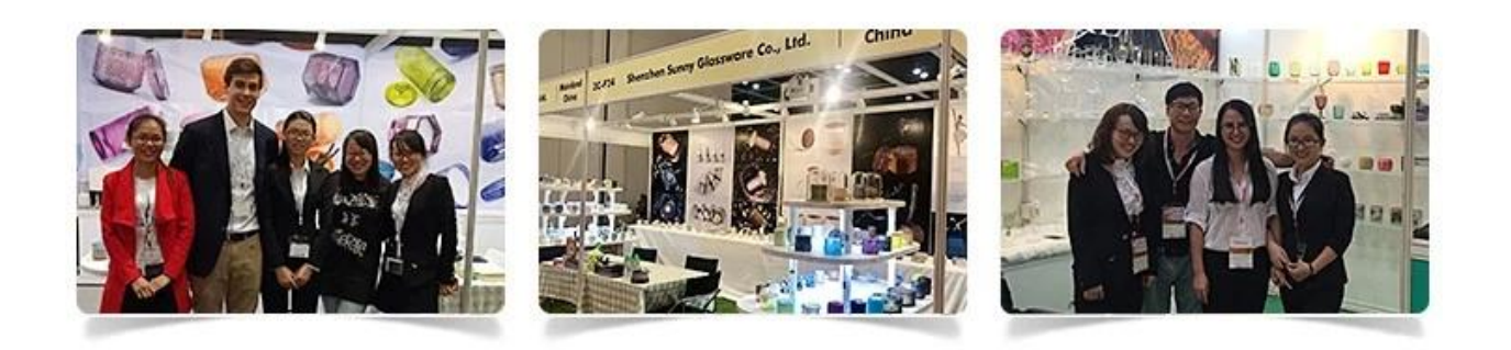
Sunny Glassware Co.,Ltd