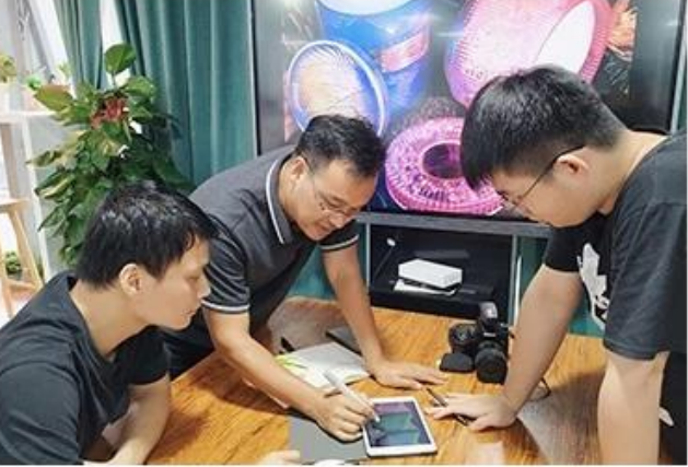
Award-winning Design Team won the trust of many upscale brands

QC Extra Six Steps No major quality complaints for 9 years