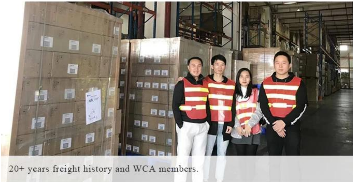
20+ years freight history and WCA members.