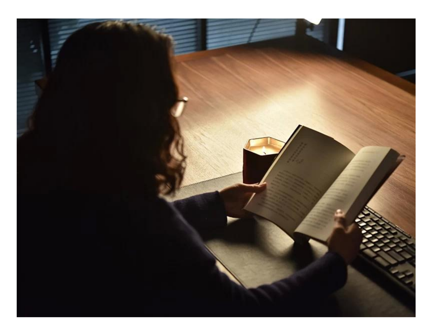
Sunny Brand Story