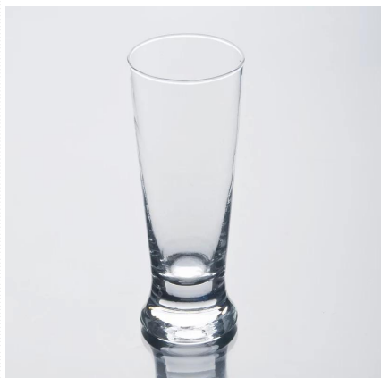
food grade glass drinking tumbler