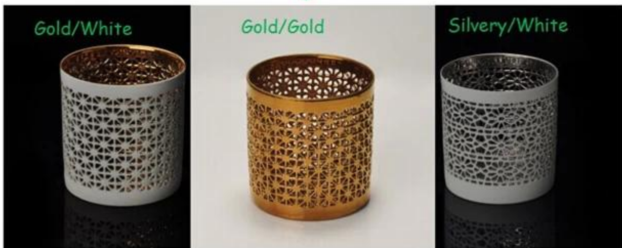
Item No.: SGJH15112207