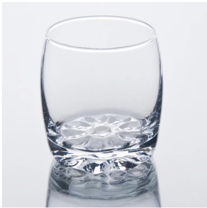
machine blown glass