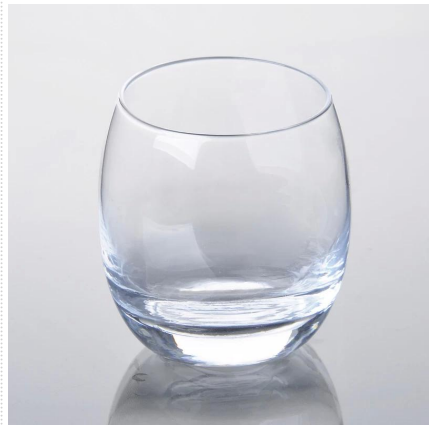
clear machine blown glass