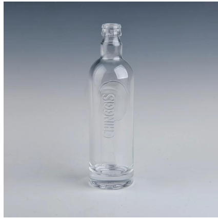
glass whisky bottle