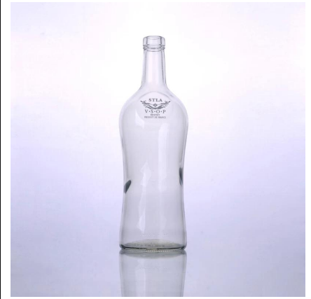
large glass whisky bottle