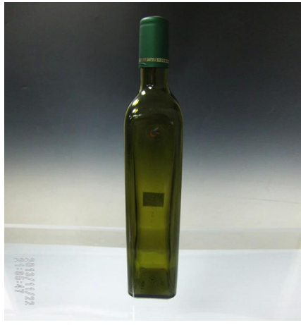
750mL Champagne Green Wine Bottle