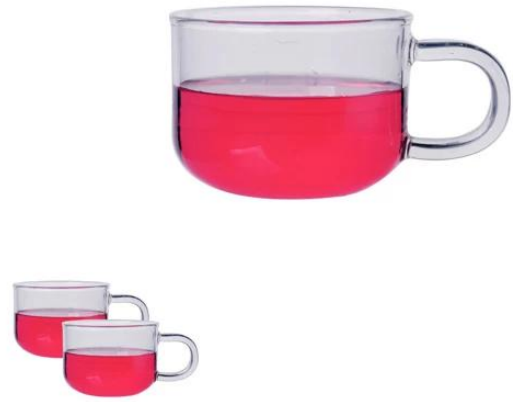
borosilicate single wall glass