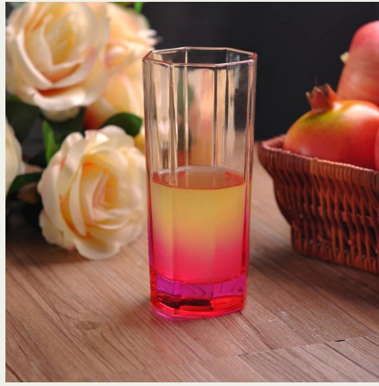
drinking glass wine manufacturers china