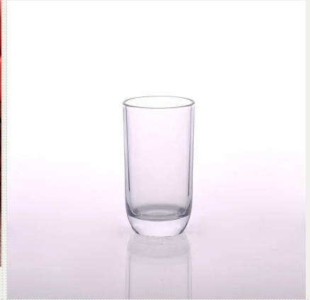
water juice milk tea drinking glass tumbler