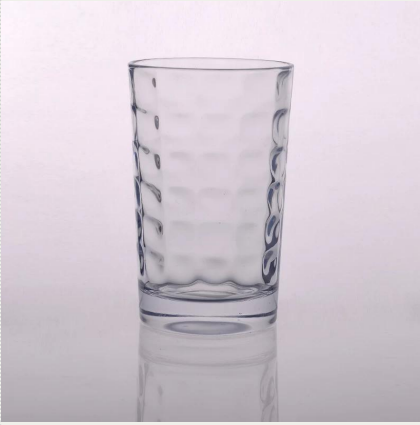
bulk new design drinking glass