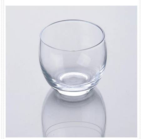
machine blown round bottom glass tumbler