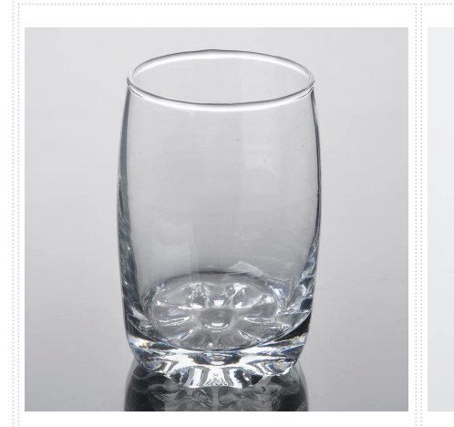
machine blown glass