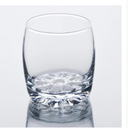
hot sale whisky glass cup