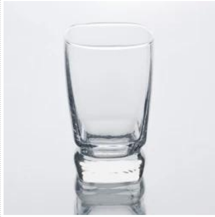
latest design glass cup_