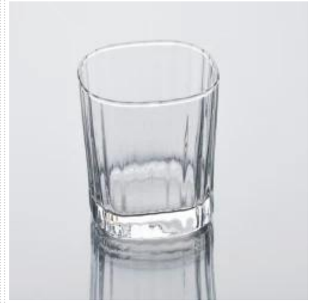
nice glass water cup

S Our Company & Sample Room Every day is sunny day