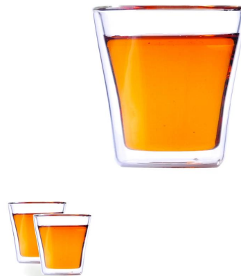
100ml Borosilicated Double Glass Tumbler