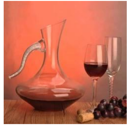
Hand quality handblown wine decanter