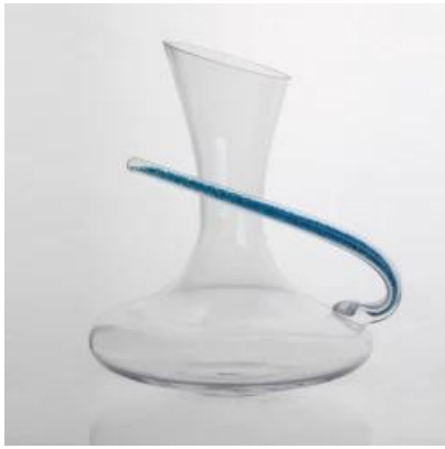
Unique design hand blown wine decanter