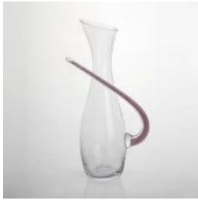
handblown wine decanter