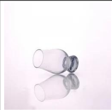
stemware beer glass