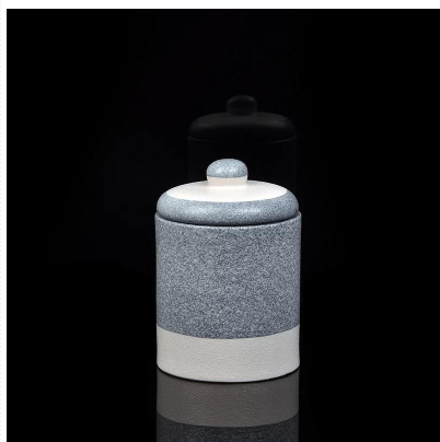
hand made ceramic candle holder