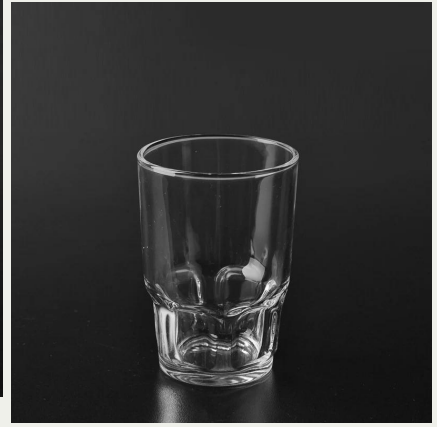
new design glasses