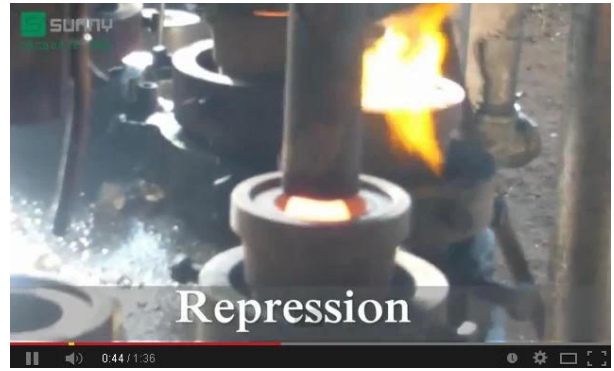
Machine Blown Method