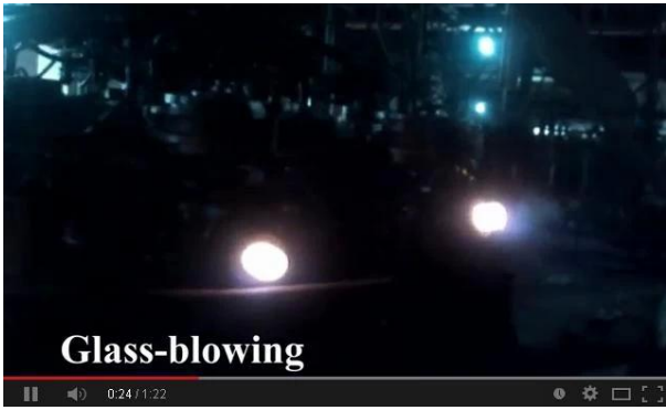
Machine Blown Method