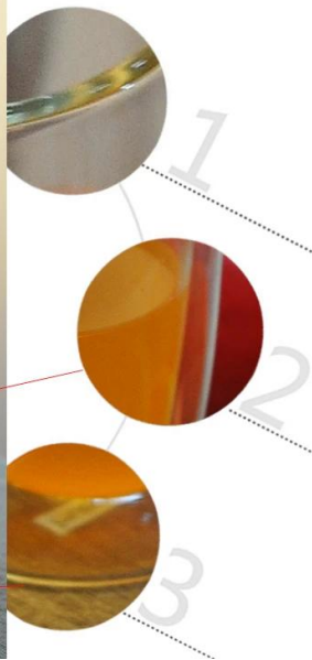
New borosilicate double wall glass drinking glass