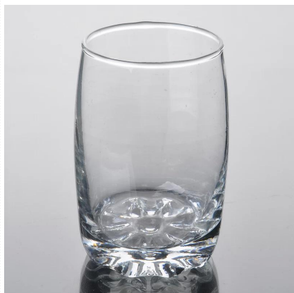
machine blown glass cup