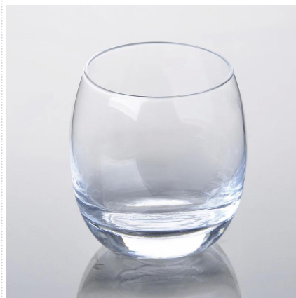
clear machine blown glass