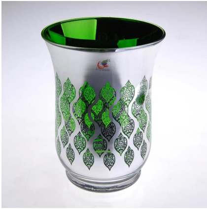
Green Tree Glass Candle Holder