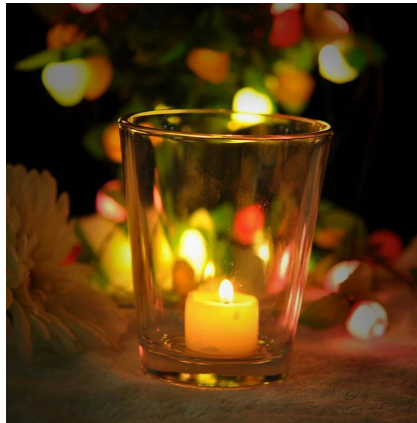
V Shape high clear candle holders