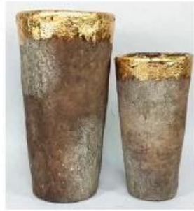
CS10024A-1 14x14x26cm CS10024B-1 11x11x20cm