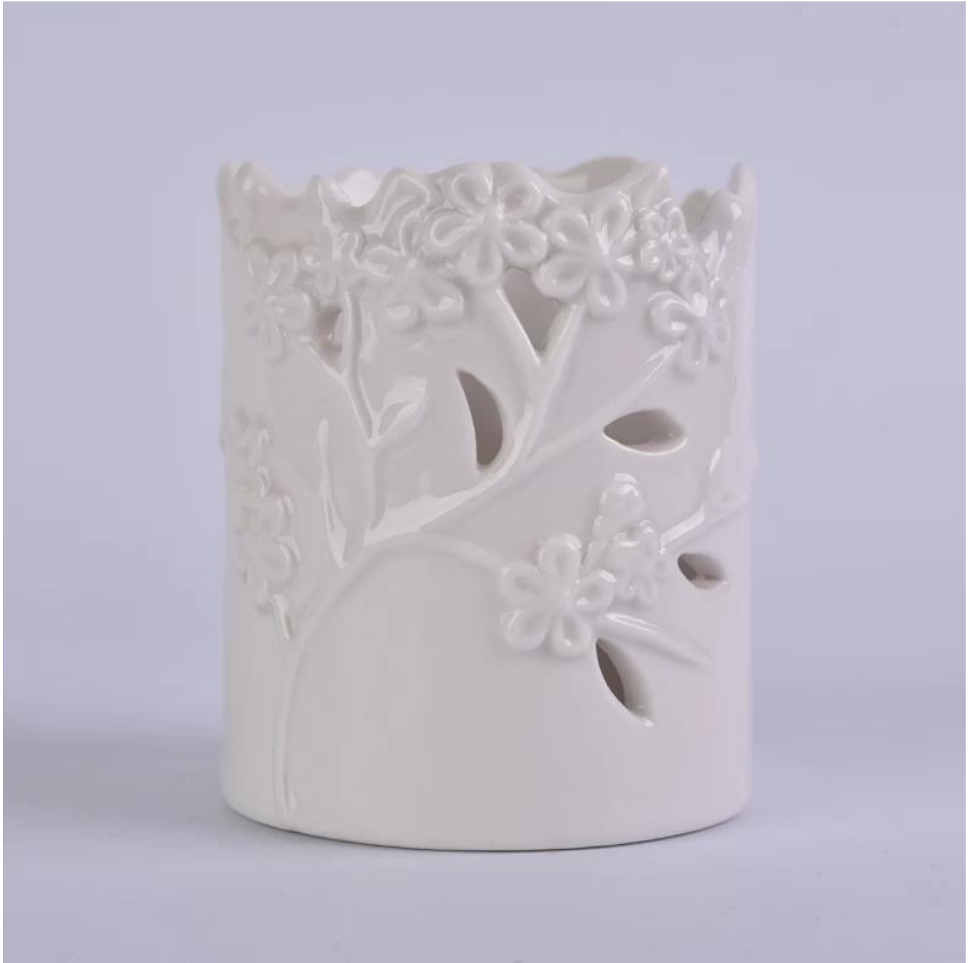
Other Ceramic Candle Holder