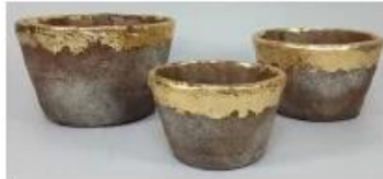
CS10026A-2 20x20x12.5cm CS10026B-2 17x17x10cm CS10026C-2 14x14x9cm