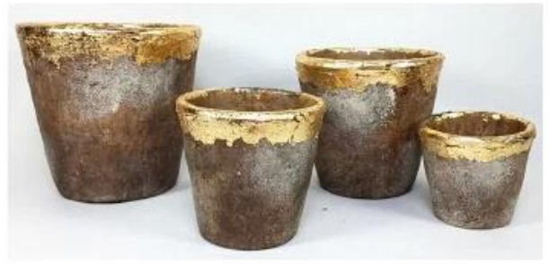
CS10025A-4 20.5x20.5x19.5cm CS10025B-4 17.5x17.5x16.5cm CS10025C-4 14.5x14.5x14cm CS10025D-4 11.5x11.5x10.5cm CS10025E-4 8x8x7cm