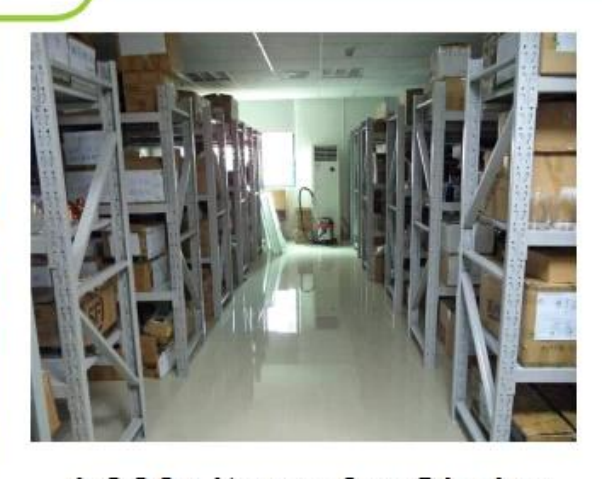
4,000+ Items for Choice