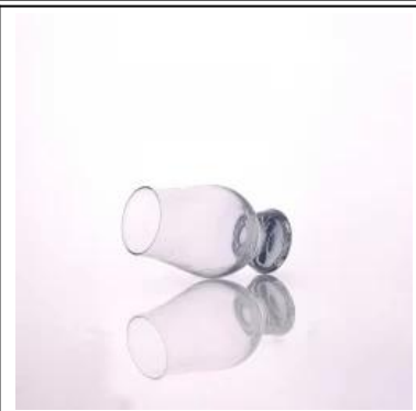
stemware beer glass