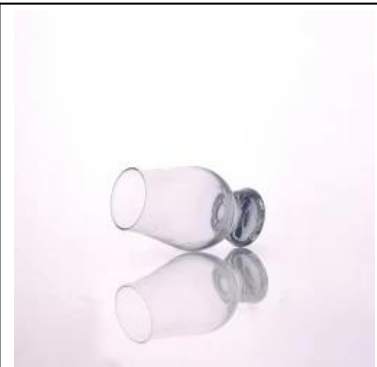
stemware beer glass