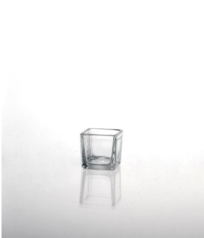
square clear glass candle holder