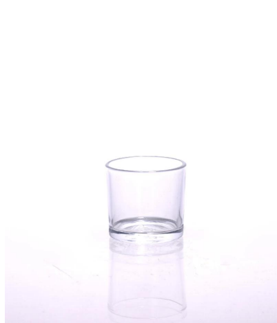
machine made glass candle holder