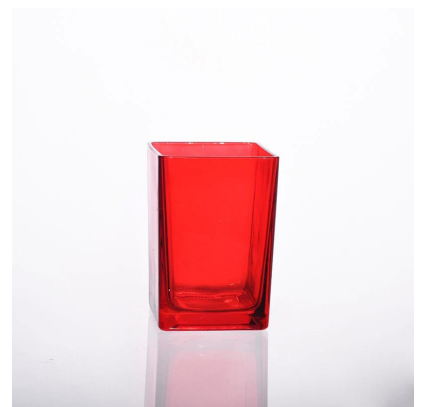
spray color glass candle holder